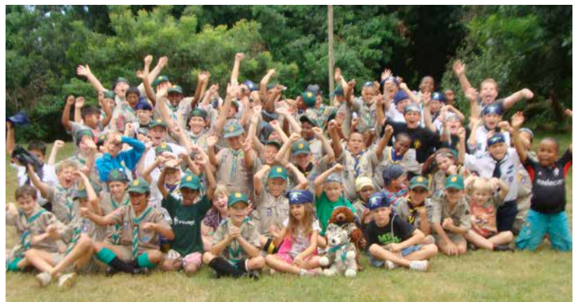
Happy pirates of the Greater Durban /Endlovini District.